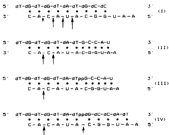
Fig.1. The scheme of pAAUGGCAUACAC hydrolysis by RNase H in duplexes I–IV.

Analysing 5'- ^{32}P -labelled products of RNA dodecaribonucleotide hydrolysis by RNase H in duplexes I–IV (fig.2), we found that in all cases site-specific cleavage took place. Substitution of the DNA probe for the chimeric probe (duplex II) resulted in a decrease in the number of hydrolysis points and in the shifting of the process to the